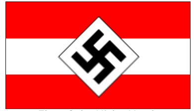
Flag of the Hitler Youth

1 Using the information from the worksheet, copy and complete the following paragraph: