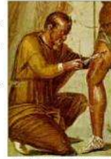
Surgeon Removing an Arrow the National Library of Medicine